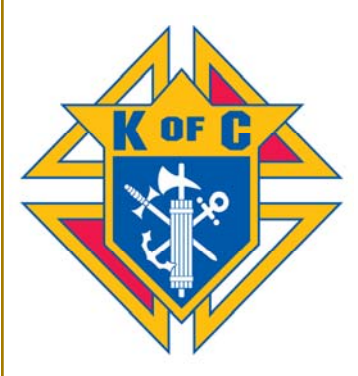
In Service to One. In Service to All

Knights of Co1umbus 180 S. Russell Ave Aurora, IL 60506